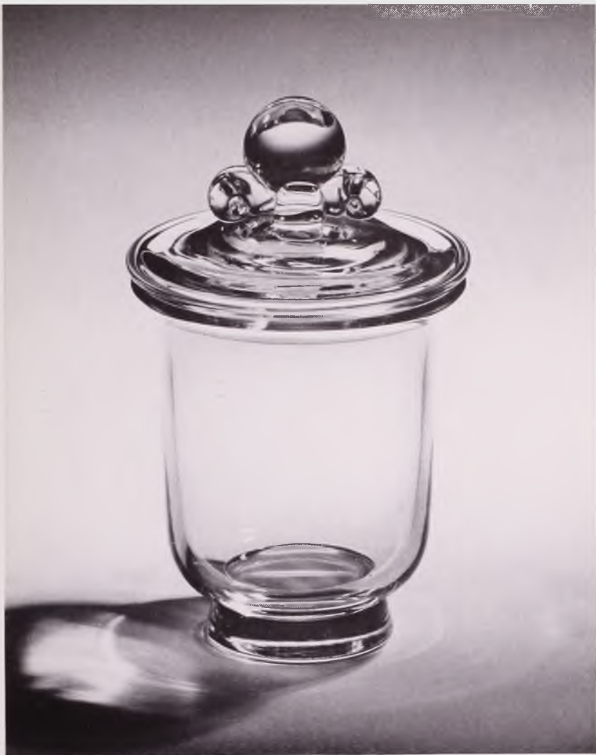
COVERED CIGARETTE JAR Height 5½", $10.00