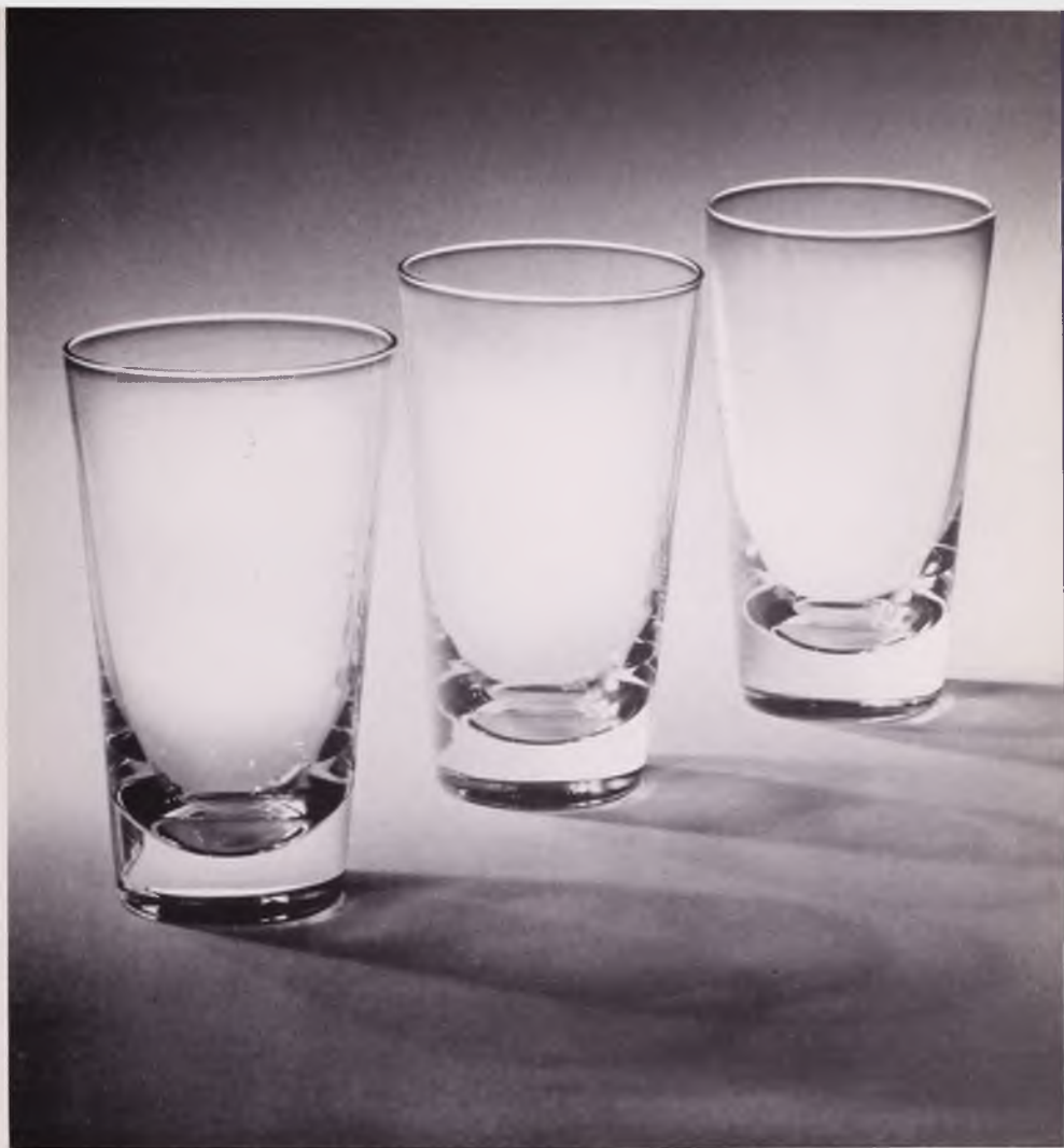
HIGHBALL GLASSES Capacity 13 oz., $42.00 dozen