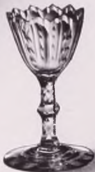
Sweetmeat Bowl Ireland Circa 1790 $95