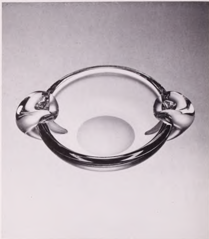
HEAVY CRYSTAL ASHTRAY Diameter 5\frac{1}{2} " , $7.00