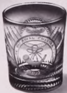
Engraved tumbler England Circa 1803 $55