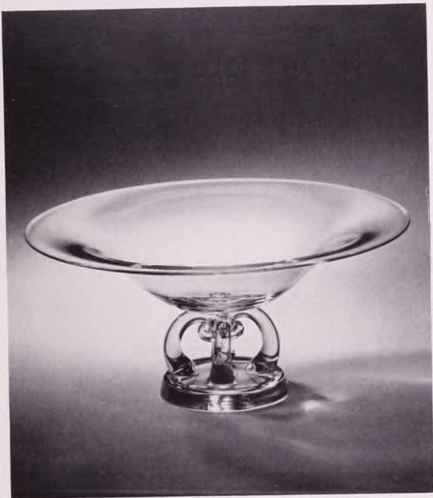
LOW CENTER BOWL Diameter 10¼", $15.00