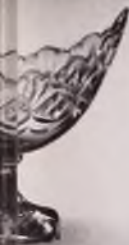
Scalloped Bowl Ireland Circa 1780 $325