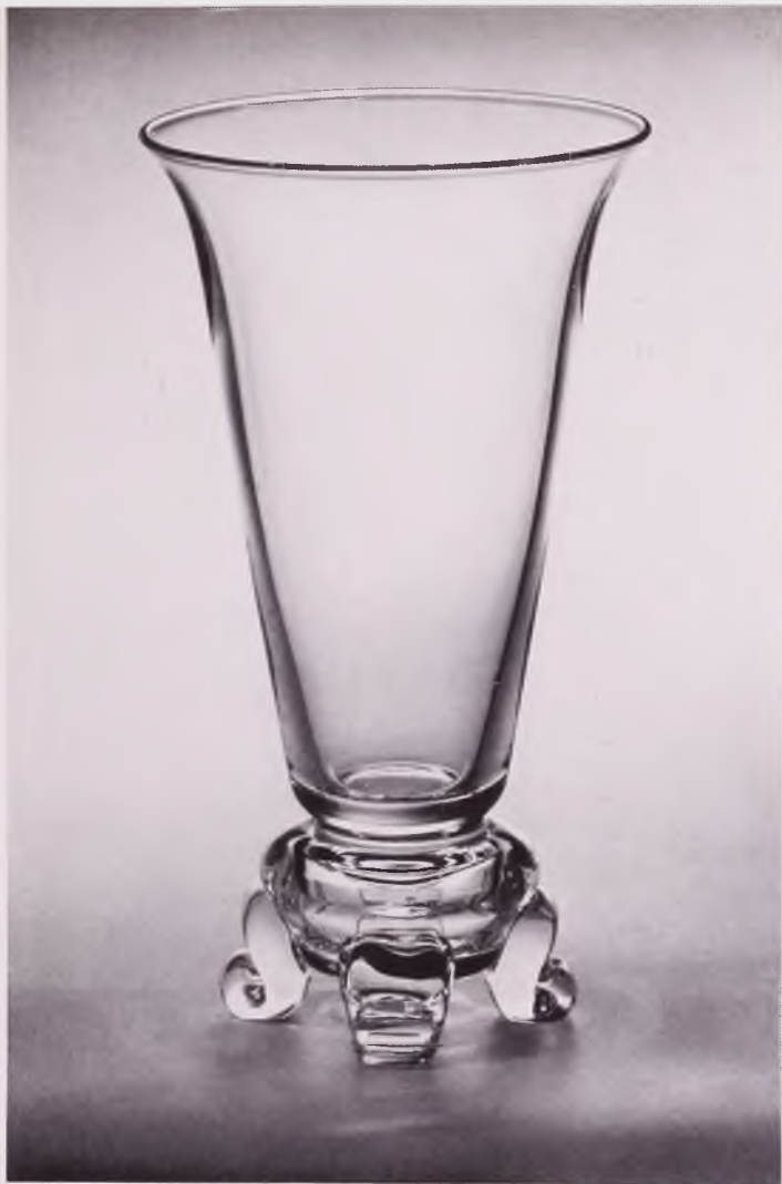
TALL FOOTED VASE Height 9½", $15.00