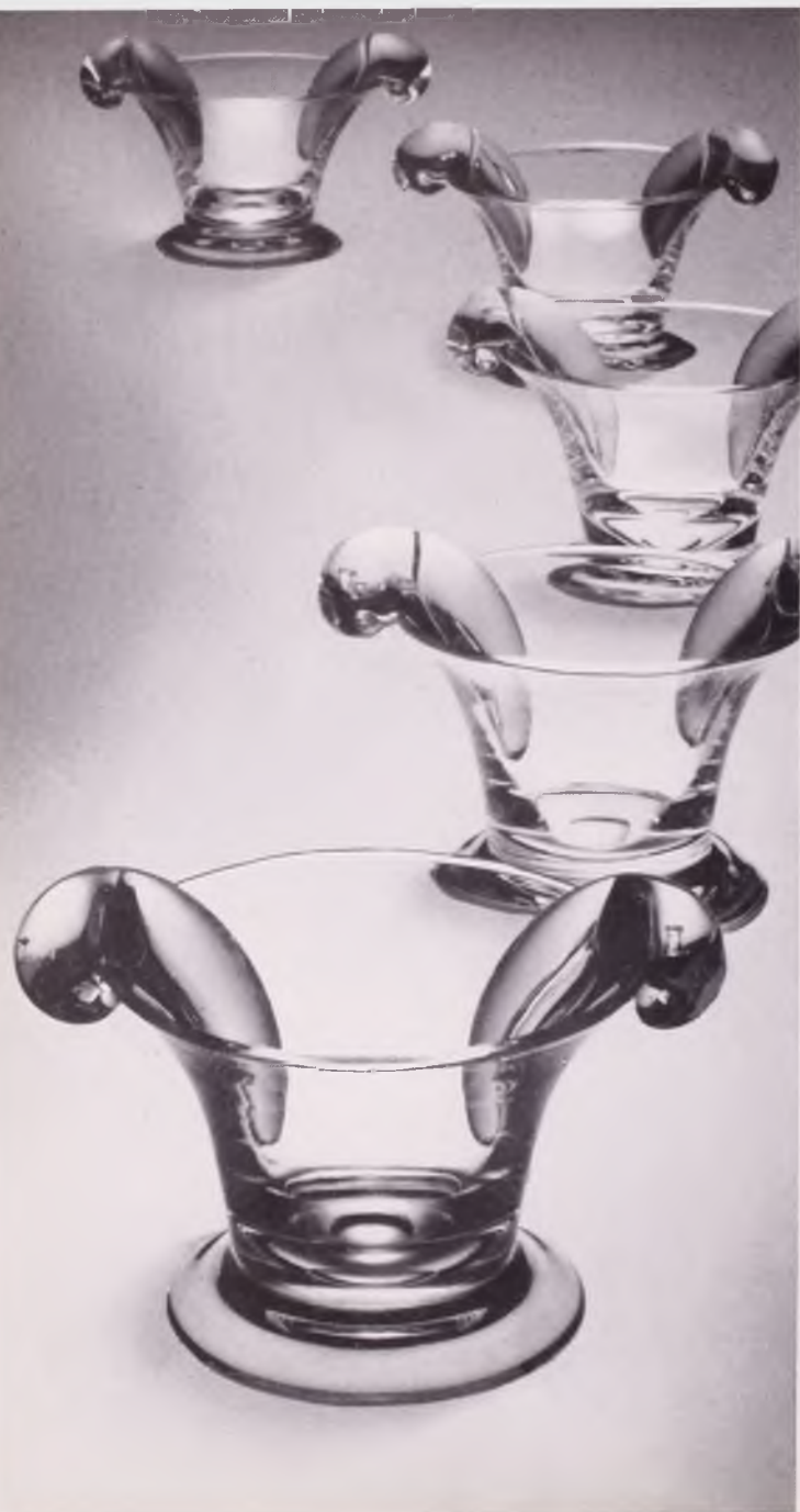
OLIVE DISHES Height 4 1/4", $8.50 each