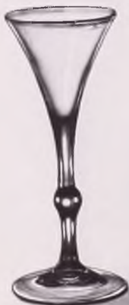
Set of 10 wines England Circa 1730 $350