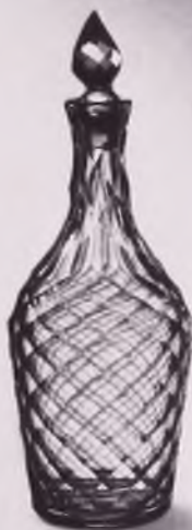
Pair of Decanters Ireland Circa 1770 $260