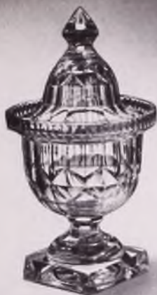
Covered Urn Ireland Circa 1790 $215.