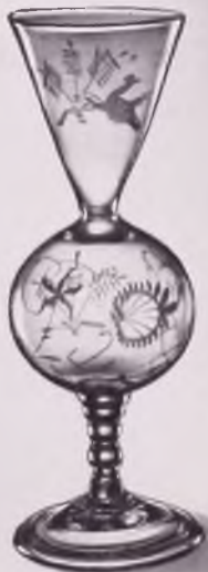
Trick Glass England Circa 1730 $165

opened an Antique Room extensive collection of English Assembled in London ex- Neil Davis, the items shown 17th and 18th century glass by rare specimens. The col- from time to time as new grand.