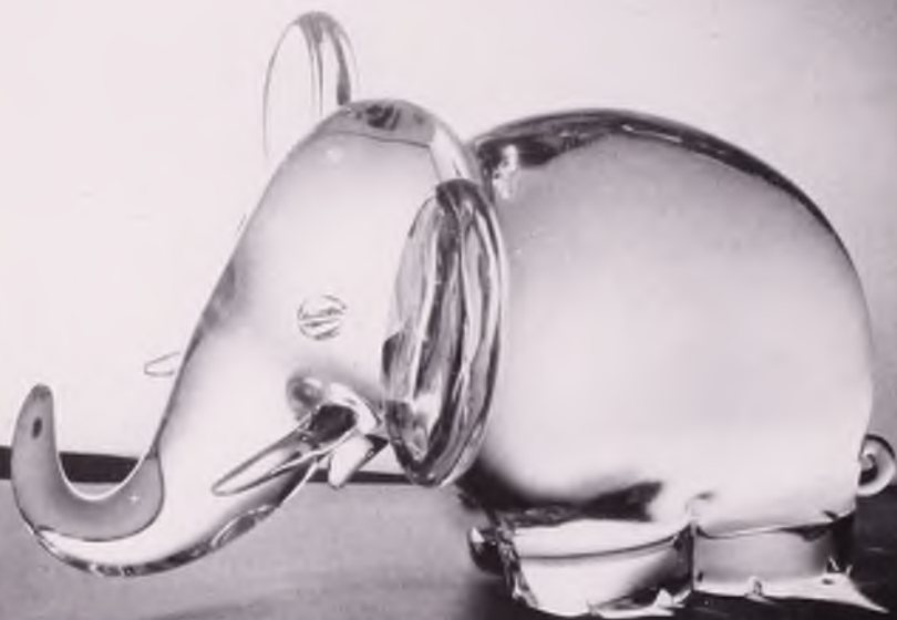
SOLID CRYSTAL ELEPHANT Length 6½", $20.00