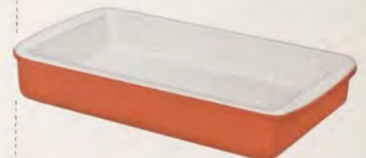
No. 932-6, 932-7