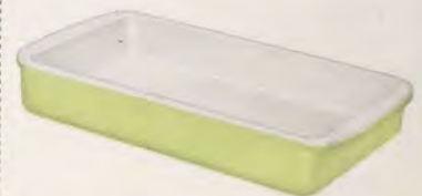
No. 931-6, 931-7