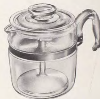
No. 7754, 7756, 7759