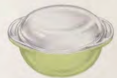
No. 980-6, 980-7