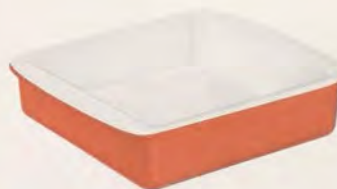
No. 922-6, 922-7