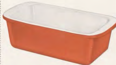
No. 913-6, 913-7