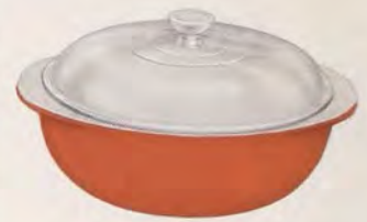
No. 924-6, 924-7