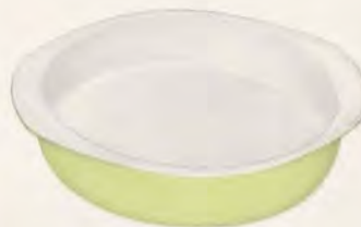
No. 921-6, 921-7