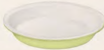
No. 909-6, 909-7