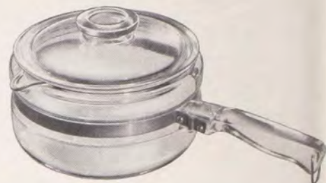
No. 6212, 6213, 6214